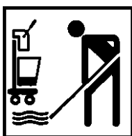
Spray mop 40:1