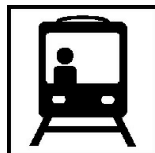
Nose End Cleaning