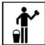
Wet Wipe 40:1