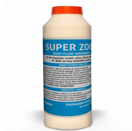
500ml easy to use tub shaker/dispenser