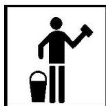
Wet wipe 60:1