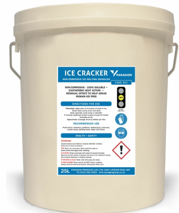
Re-sealable plastic tubs