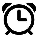
min 60 sec contact