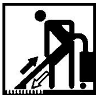
Normal Use 80:1