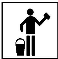
Wet Wipe 60:1