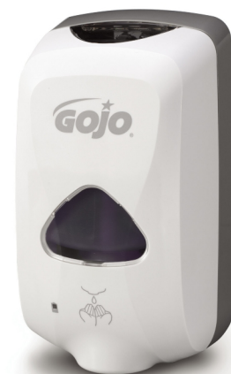
TFX Touch-Free Dispenser

1000 applications per 1200ml cartridge. Use through hygienic touch free dispenser.